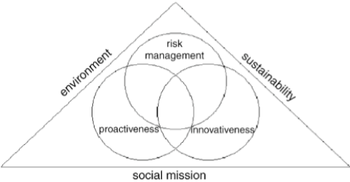
Figure 2: Weerawardena & Mort’s (2006) Multidimensional Model of Social Entrepreneurship